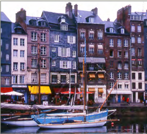
PORT OF HONFLEUR

15 days of gardens, chateaus, and must-see places of interest. Below is the itinerary at a glance.